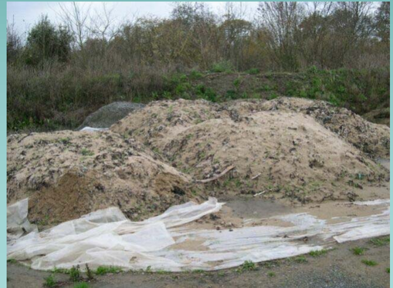
Temporary storage of seaweed end sediment