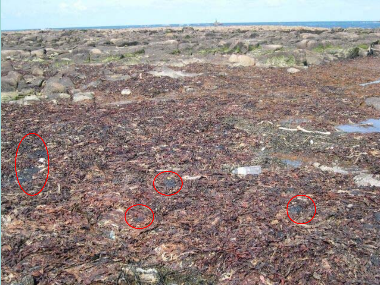
Sporadic oiling (tarballs / pellets)