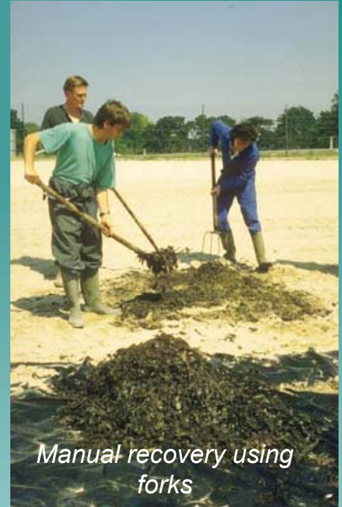
Manual recovery using forks