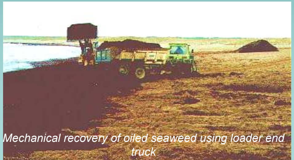
Mechanical recovery of oiled seaweed using loader end truck