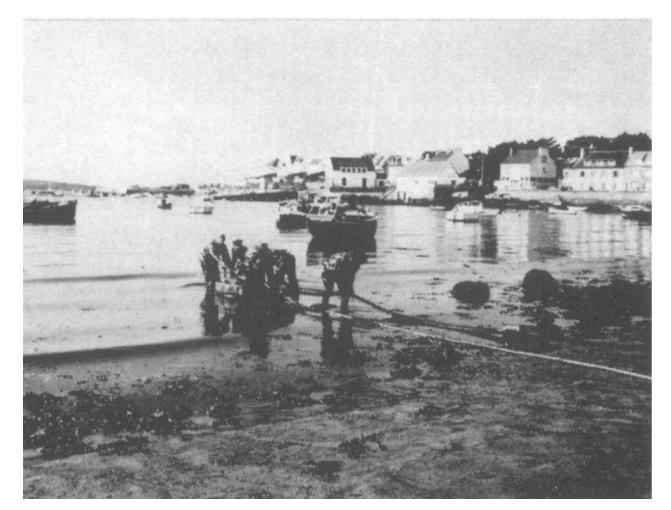
Figure 2. ACME skimmers being used in Portsall Harbor during the first few days after the spill incident