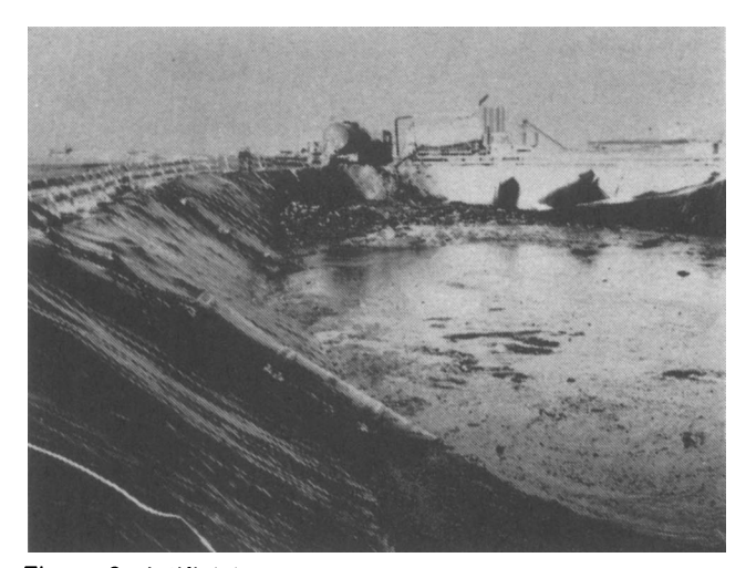
Figure 9. Artificial pond near Brest Merchant Harbor being filled with the more liquid portions of oily waste from the Amoco Cadiz spill

Many difficulties have also been encountered in dealing with the products found at the bottom of the "honey-wagons", the trucks, and the ships. These residues are actually deposits that cannot yet be deemulsified. Carriage of these residues also appears quite impossible for they are too viscous for pumping, yet not solid enough for freestanding in trucks.