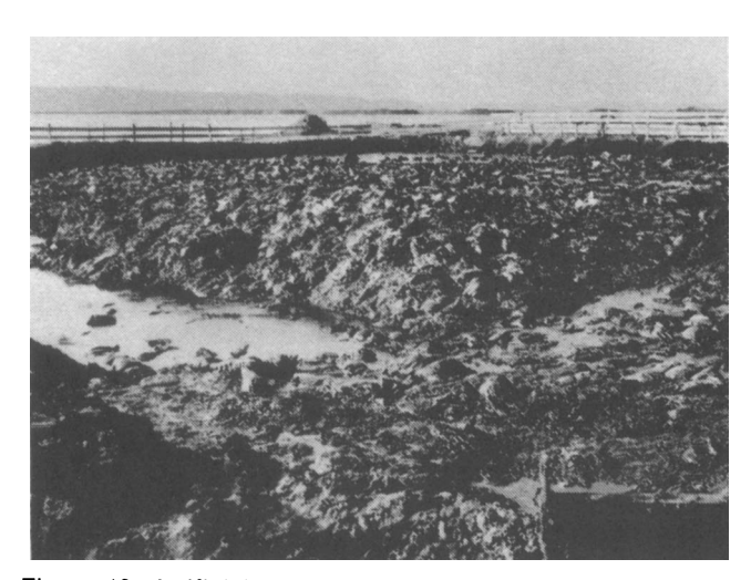
Figure 10. Artificial pond near Brest Merchant Harbor filled with oily debris which has been treated with quick lime