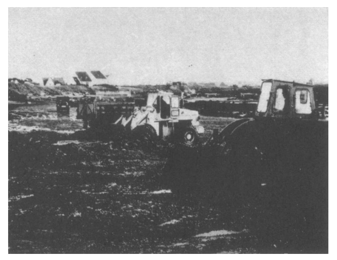
Figure 6. Front-end loaders removing oily sea weed from a beach near Portsall

ually by a great number of soldiers. More than seven thousand men worked along the coast picking up the seaweed and putting it in plastic bags. These bags were then collected on the beaches by farmers' tractors and trucks, and transported to dump sites in Brest and Tregastel. In some sections, front end loaders and trucks were used (Figure 6).