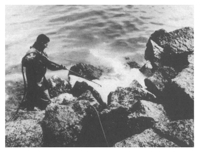
Figure 8. Cleaning of rocks using high pressure, hot water hosing technique

Such processes were effective between the sixth and ninth weeks after the Amoco Cadiz grounding. After that, high pressure, hot water pumps working at a pressure of 140 bars (2,000 psi) with a relatively low flow rate of fresh water heated to between 80° to 140°C, were used with very good efficiency under all circumstances for the next few months (Figure 8). One man could clean more than 500 square meters (about 5,000 square feet) of rocks per day at the begin-