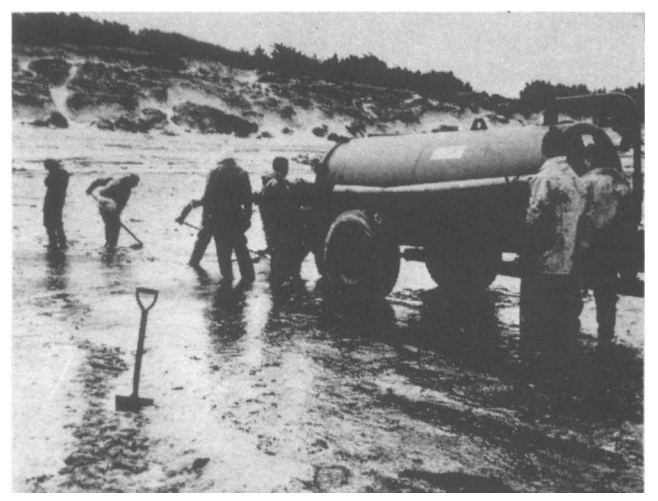
Figure 4. Pumping the oil trapped in a small beach pond by use of a "honey wagon's" vacuum pump