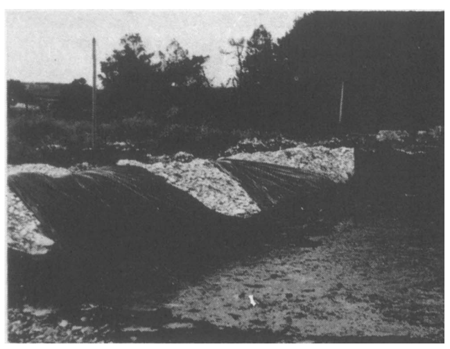
Figure 5. Temporary storage of oily residue in a lined dug pit near Roscoff

Often, when a pumping possibility existed, that is, when the oil was gathered in a bay, access was rather difficult. The farmers, driving their tractors pulling vacuum tanks designed to handle liquid manure (called "honey wagons" in the U.S.A.) would come and pump out the "chocolate mousse" water-in-oil emulsion which spoiled every place along approximately 400 kilometers (250 miles) of the Brittany coast (Figure 4).