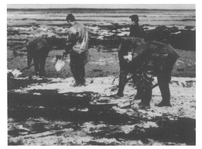
Figure 7. Hand removal of emulsified oil covering a beach

The thick layer of mousse which still spoiled the upper part of the beaches was picked up, mostly by men with shovels and buckets, but sometimes with public works loaders (Figure 7). Some attempts were made to thicken the mousse layers by scraping and gathering the oil with public works scrapers or by twenty meter long booms dragged over the sand behind two tractors. These two techniques required flat beaches without any rocks, but were sometimes very helpful, specially when the wind pushed mousse into a corner of the boom. This mousse, when collected, contained a large amount of sand and was kept, as was the oily seaweed, for further treatment.