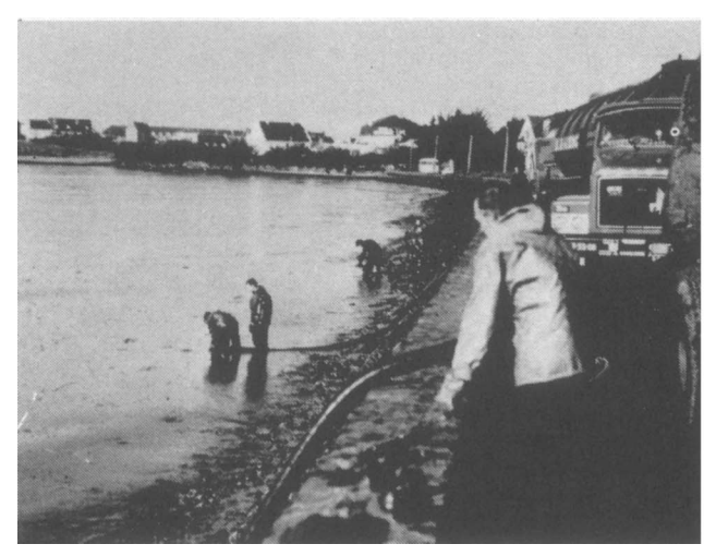
Figure 3. Pumping oil from the surface of the water using vacuum trucks near Portsall.