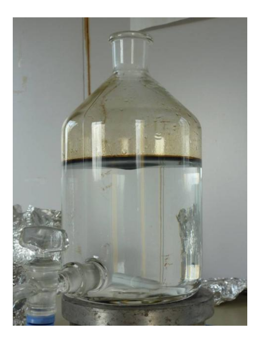
Figure 2: Preparation of an oil WAF

In order to conduct the Delta Tox trials, Water Accommodated Fractions (WAF) were prepared for all the oils following the method described by Barron et al. , 1999 as well as by Hokstad et al , 2000 (Figure 2).