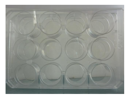
Figure 4: Multiwell plate used for toxicity testing on Artemia larvae and cysts.