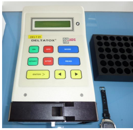
Figure 3: Delta Tox field instrument

The photons produced by the bacteria were amplified and measured with a Photon Multiplier Tube (PMT); the difference between the number of photons produced before and after contamination was used to estimate the toxicity of the sample tested.